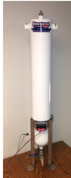
Legs are optional